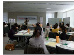
Seminar on career development for female university students

JAWE conducts a variety of seminars related to support for childcare, learning, and career-building in joint cooperation with centers for the promotion of gender-equality, lifelong learning centers, non-profit organizations, universities, and local government organizations throughout Japan.