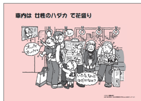
“Train cars filled with pictures of naked women”