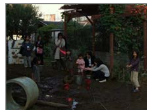
Seminar for Training Childcare Supporters

These seminars, targeted at those engaged in activities related to childcare support in communities, seek to promote understanding of current issues pertaining to childcare support and explore and exchange ideas regarding the role of childcare supporters from the viewpoint of building and strengthening community cooperation and support for childcare.