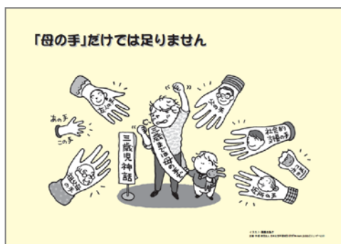
“Caring for children isn’t just the mother’s responsibility”

This set of panels with humorous illustrations on various themes related to gender-equality is available for rental to various groups and organizations, such as gender-equality centers, schools and universities.