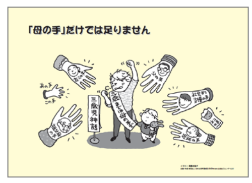
"Caring for children isn't just the mother's responsibility"

This set of panels with humorous illustrations on various themes related to genderequality is available for rental to various groups and organizations, such as genderequality centers, schools and universities.