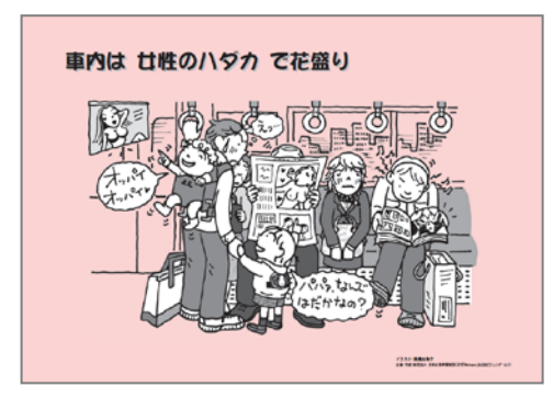
"Train cars filled with pictures of naked women"